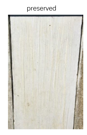
■ Figure 2 & 3: Exposure in India after two monsoons with and without Preventol® next A6-D